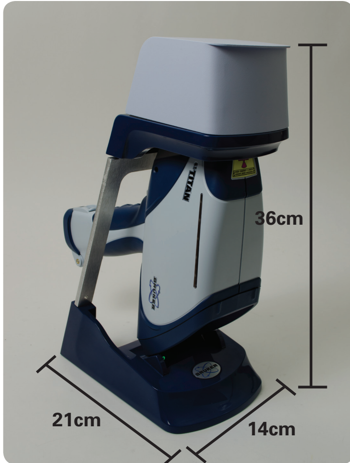
Overall Dimensions (maximum): 36cm x 21cm x 14cm, 2kg (H x D x W)