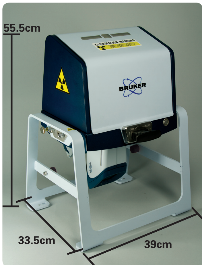
Overall Dimensions (maximum): 55.5cm x 33.5cm x 39cm, 15kg (H x D x W)